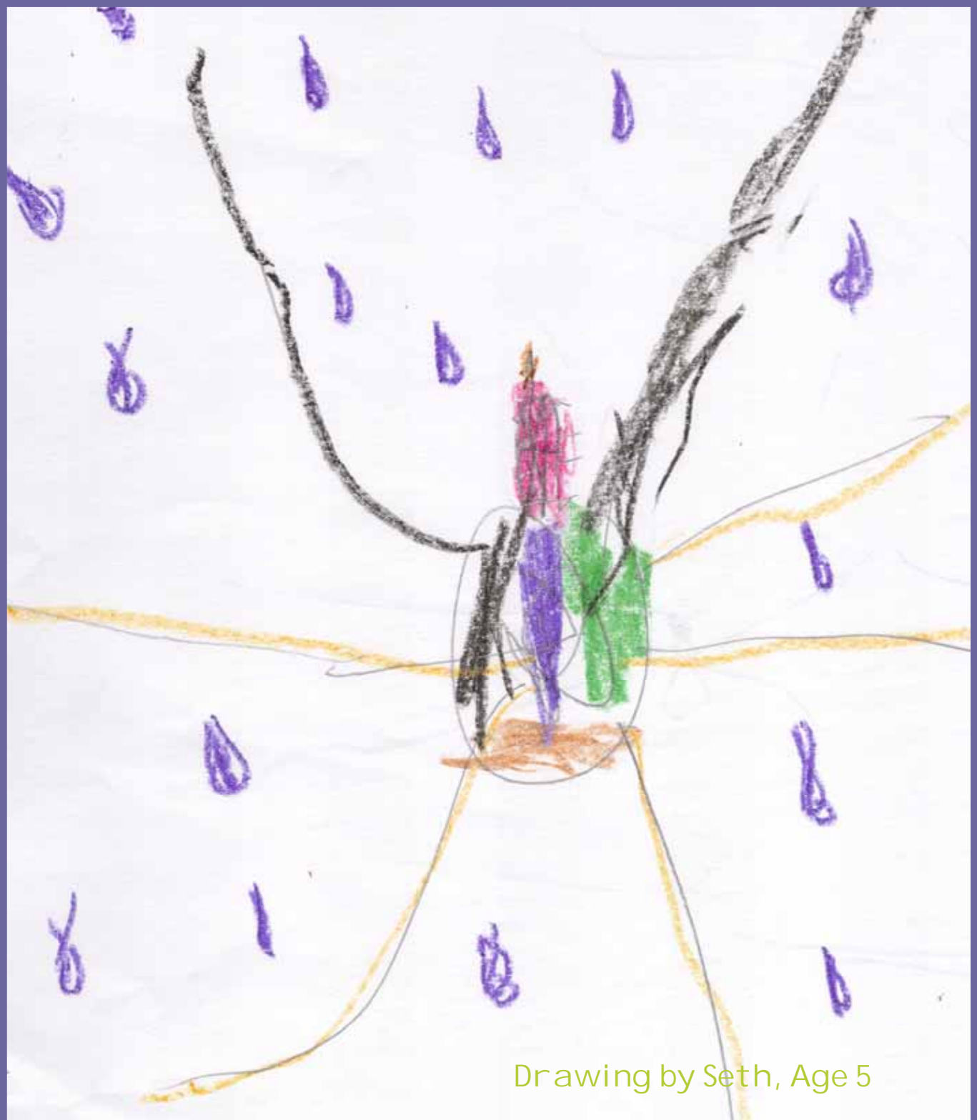
Drawing by Seth, Age 5

Why did the jelly bean go to school? To become a smartie.