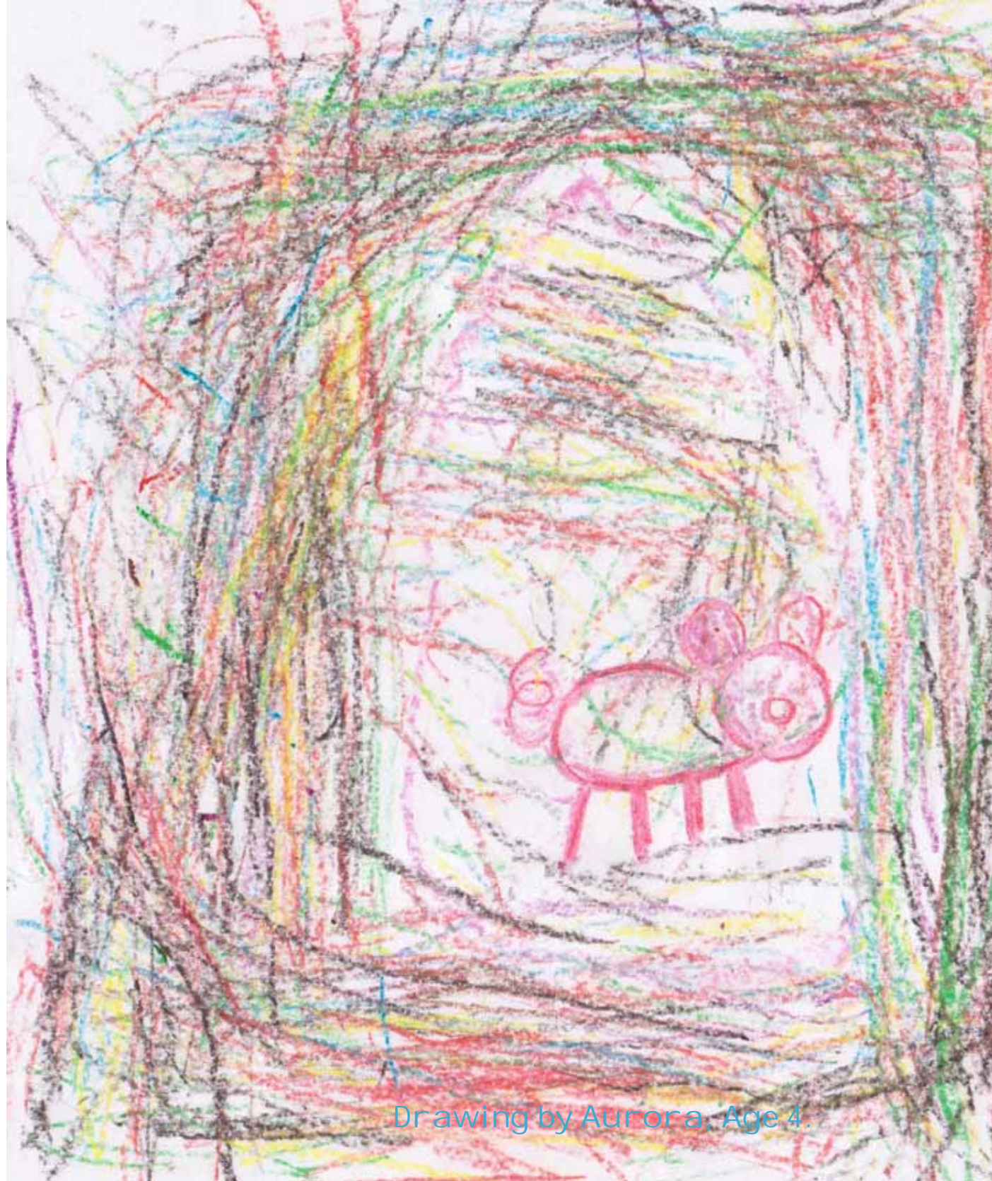
Drawing by Aurora, Age 4.